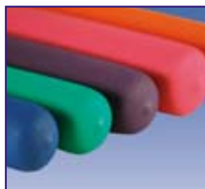
Soft Texture Finish