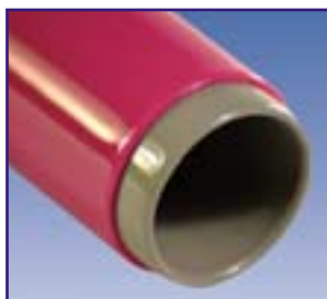
Double Dip Grips