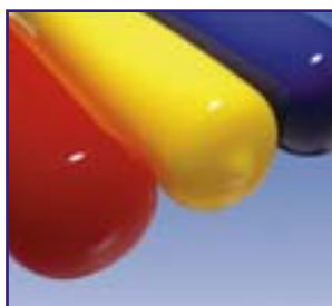
High Gloss Finish

*Length can be adjusted in 1/16" increments beginning at 1/4". For sizes not listed please contact a Caps'n Plugs Salesperson.